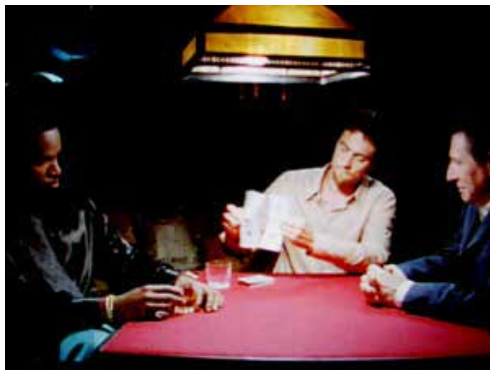
ABOVE: Stuart Townsend Performing The Ripper in Shade.

Shade is set in the world of poker hustlers working the clubs and martini bars of Los Angeles. The tale unfolds as a group of hustlers encounter "The Dean" and pull off a successful sting that results in their pursuit by a vengeful gangster.